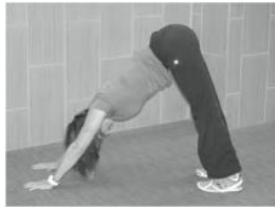
Hold this exercise for one minute.

Start on your hands and knees. Your hands should be directly below your shoulders; your knees should be in line with your hips.