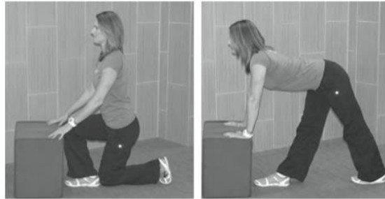
Hold this stretch for one minute.

Kneel down in front of a chair or table that you can use to stabilize and support your body. Place the back of your left heel on the front of your right knee. Be sure that you are up on the toes of your right foot, with the bottom of your foot pointing behind you. Keep your left foot, your right knee, and your right foot in line with each other.